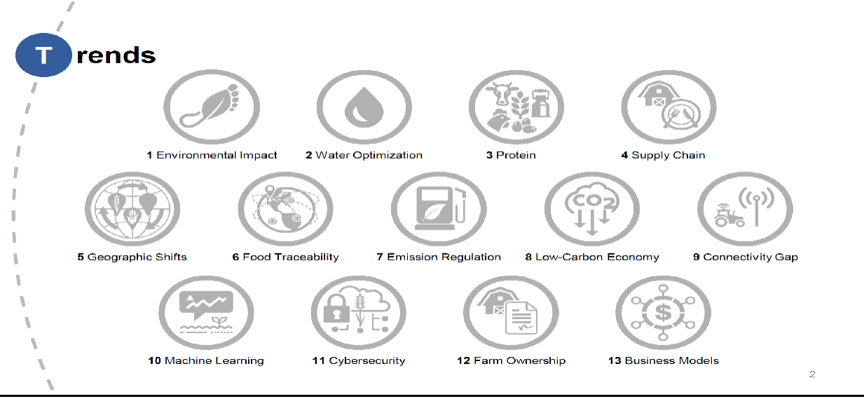
AEM, Future of Food Production, \underline{https://www.aem.org/future-of-food-production}

The evolution of agriculture and the future of food is being driven not only by technology but also by changing consumer preferences, social trends, overall increasing global demand for food and, of course, climate change. How and which foods are produced where has economic, demographic, political and environmental impact. Precision agriculture can address many of the challenges and opportunities the future presents.